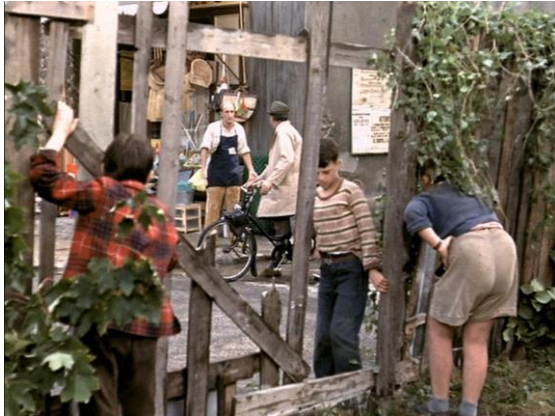
3. MON ONCLE, F 1958, Jacques Tati