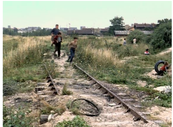
4. MON ONCLE, F 1958, Jacques Tati