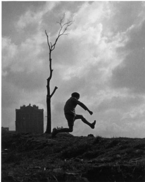
5. Robert Doisneau: La poterne des peupliers (1934)