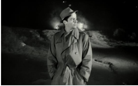
1. LE DOULOS, F 1963, Jean-Pierre Melville